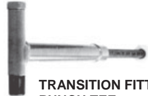
TRANSITION FITTING PUNCH TEE