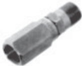
SERVICE HEAD ADAPTER