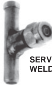
SERVICE TEE WELD X COMPRESSION