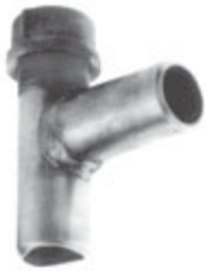
SERVICE TEE WELD X WELD