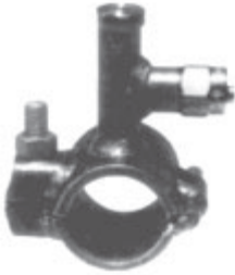
SERVICE SADDLE TEE FOR STEEL MAIN